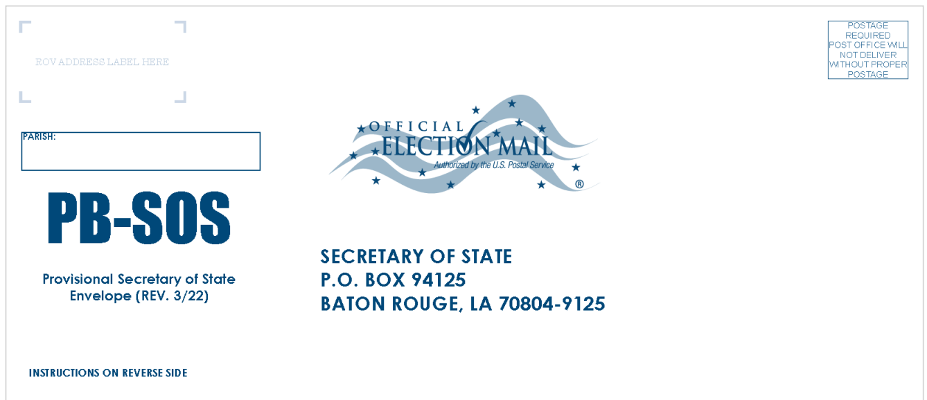
Figure 12: Provisional Ballot Secretary of State Envelope (PB-SOS) (Front Only)